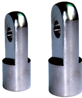
Table for I knuckle and cylinder